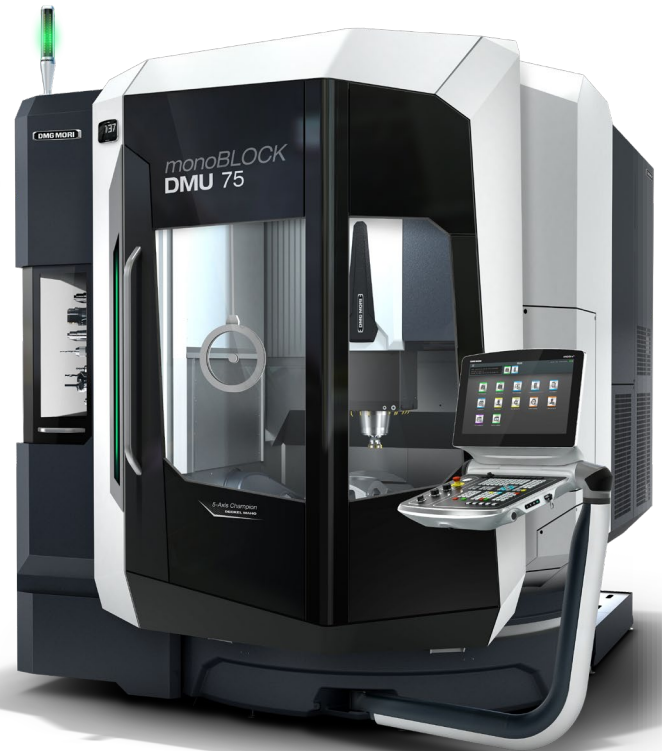
DMU 75 monoBLOCK 2 nd Gen. – highest productivity, among others through technology integration. Thus up to 5 integrated processes are possible on one machine.

DMU 65/75 monoBLOCK 2 nd Gen. – Highly accurate, temperature stable and productive: The compact and easy-to-automate DMU 65 and 75 monoBLOCK of the second generation combine the experience gained from more than 6,000 machines supplied in the monoBLOCK series with 30% higher volumetric accuracy, 20% better temperature stability and maximum productivity by integrating milling, turning, grinding, gear cutting and measuring on one machine. The consistent combination of machines, technologies, users, automation and digitization enables a high degree of process integration for resource-saving and efficient production.