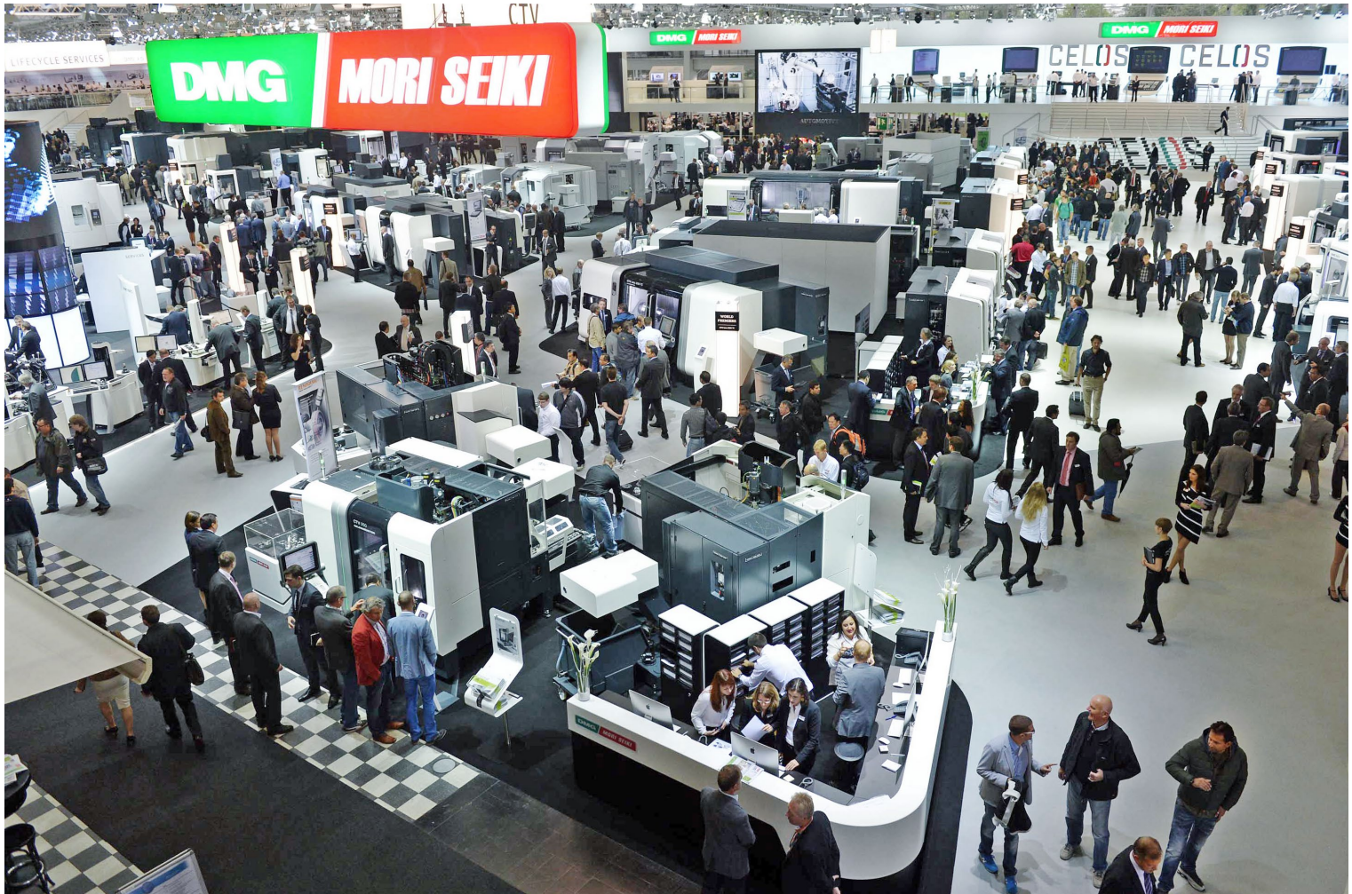
DMG MORI SEIKI at the EMO 2013: The trade visitors' main interest focused on CELOS - from the idea to the finished product, the new joint machine design and 18 world premieres.